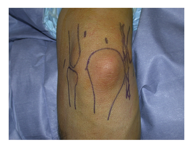
Figure 1 Anatomic landmarks drawn before arthroscopy.

Arthroscopic portals are drawn, including a standard medial (viewing) portal.<sup>14</sup> The elbow joint is inflated with 30 mL of