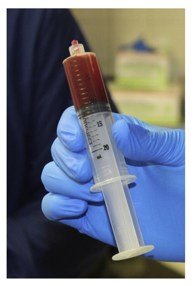
Figure 1 After extraction of bone marrow aspirate at the time of intervention, bone marrow aspirate concentrate (pictured) can be processed in minutes for injection to the site of injury.

cord blood, and placental tissue, but most available clinical evidence is centered on bone marrow aspirate concentrate (BMAC) and adipose-derived injections. The MSCs derived from these therapies have been identified in vitro to differentiate into bone, cartilage, tendon, muscle, and adipose tissues, which has generated significant interest in their ability to improve healing in most tissue injuries. The most differentiate into bone, cartilage, tendon, muscle, and adipose tissues, which has generated significant interest in their ability to improve healing in most tissue injuries.