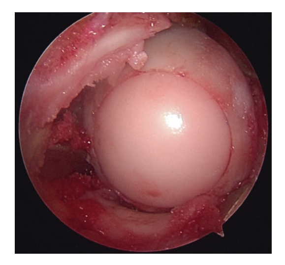
Fig. 32.2 Intraoperative image illustrating an osteochondral allograft transplantation to lateral femoral condyle

OCA is often used in patients with larger (>2 cm) lesions. In the operating room, the patient is positioned supine with a tourniquet. The procedure begins with a knee examination under anesthesia. A lateral or medial parapatellar incision is then made to access the FCD. There are two general techniques that exist for OCA: cylindrical press-fit plugs or free-shell grafts. Whichever technique is used, donor tissue must be size matched to individual patients based on X-ray, CT, or MRI measurement.