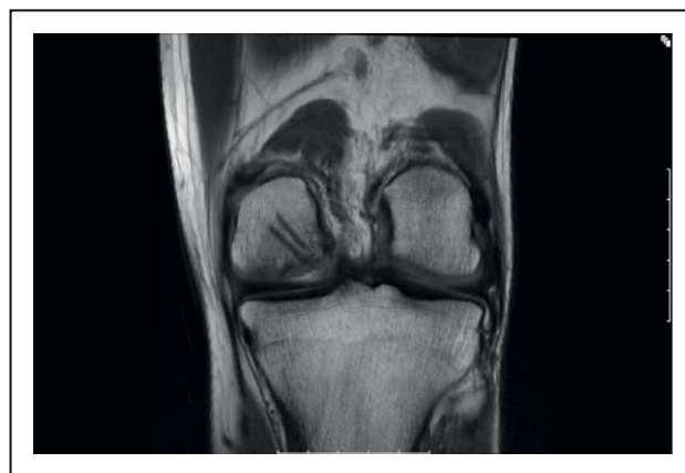
FIGURE 3. A 1-year follow-up after ORIF with bioabsorbable tacks. Osteochondritis dissecans lesion completely healed.