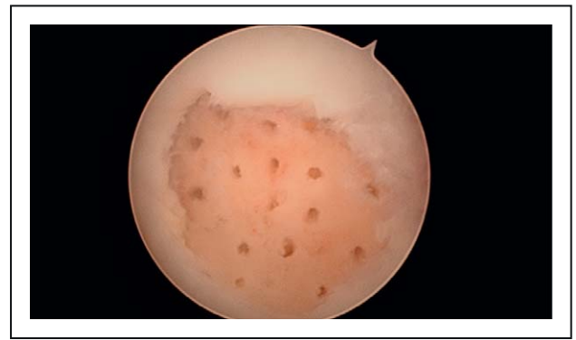
FIGURE 5. After fragment removal, microfracture was performed. Note the lesion is ideal for microfracture, with chondral defect with good cartilage shoulders.

Miniaci and Tytherleigh-Strong [23] and remains a consideration for a defect that has an intact, relatively stable fragment within the defect bed. Gudas et al. [22] reported a prospective, randomized study comparing microfracture with osteochondral autologous transplantation in OCD and found that both groups demonstrated substantial improvement initially in clinical symptoms and in their International Cartilage Repair Society scores, but the microfracture group deteriorated over time, with 41% failing (based on pain and joint swelling necessitating a second-look surgery) at 4 years compared with none in the transplant group.