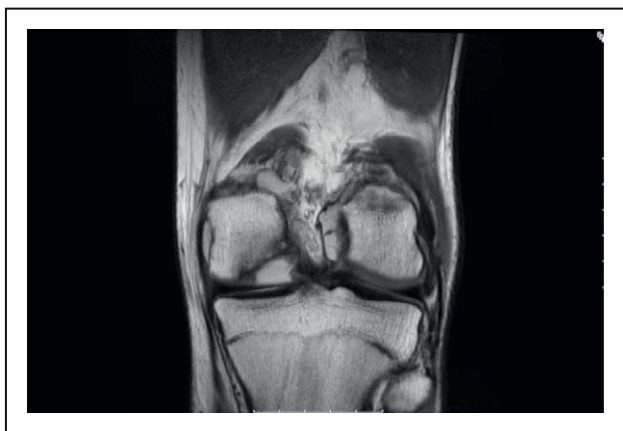
FIGURE 2. 18-year-old man with osteochondritis dissecans of the knee. Typical osteochondritis dissecans location on the lateral aspect of the medial femoral condyle. Note the high signal at the interface with cartilage and bone suggesting loosening.

Several concepts must be considered during the decision-making process before recommending a microfracture procedure. Our decision to