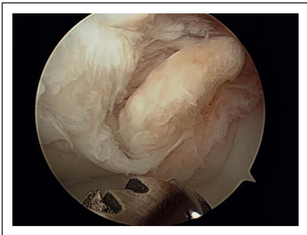
FIGURE 4. Typical osteochondritis dissecans lesion located on the medial femoral condyle with loose body.

This technique is ideal in those case scenarios wherein the underlying subchondral bone integrity has been significantly compromised. It could be considered as a second-line treatment after a failed microfracture or as a first-line treatment of high-demand patients with small chondral lesions. A novel technique of using an osteochondral autograft plug as a biologic splint has been reported by