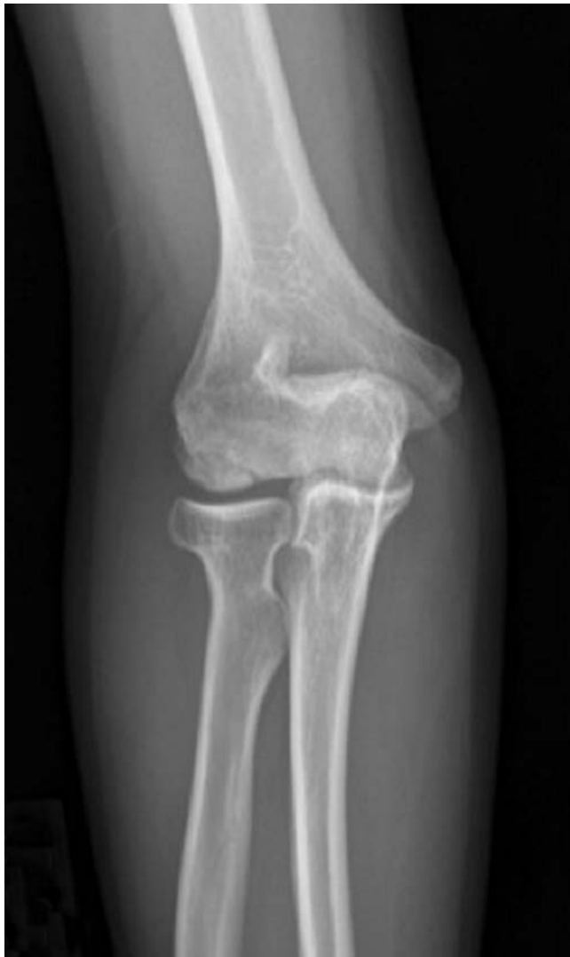
Figure 3 AP radiograph showing OCD of the capitellum in which there is a complete fragment with subtle displacement. Such a lesion often has a relatively normal arthroscopic appearance because the articular cartilage is intact.

dle or lateral capitellum, a grade II lesion has a split line or clear zone between the lesion and its subchondral bone, and loose bodies are present in a grade III lesion. 32