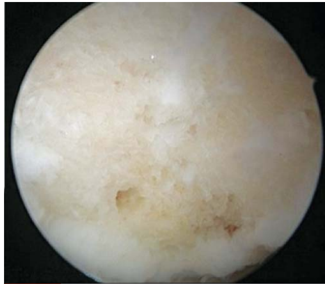
Figure 4 Arthroscopic image showing an OCD lesion after microfracture.

MRI has become the modality of choice for evaluating these lesions. Early changes not found on plain radiographs can be detected on MRI, and the size, location, and stability of the lesion can be assessed. The key to making a treatment decision is to determine whether the articular surface is intact and the lesion is stable as seen on MRI. A peripheral ring of fluid or fluid under the articular surface suggests an unstable lesion; these findings are similar to those of an OCD lesion in another area of the body. The diagnosis sometimes is facilitated by the addition of arthrographically or intravenously administered gadolinium.