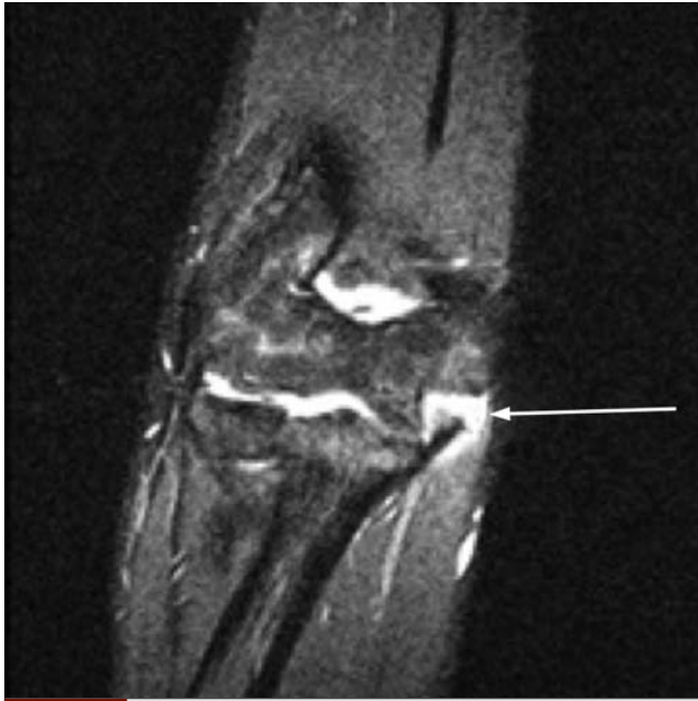
Figure 2 MRI showing a complete avulsion of the UCL from the humeral epicondyle (arrow).

side-to-side differences between the athletes' throwing and nonthrowing arms. 9,10