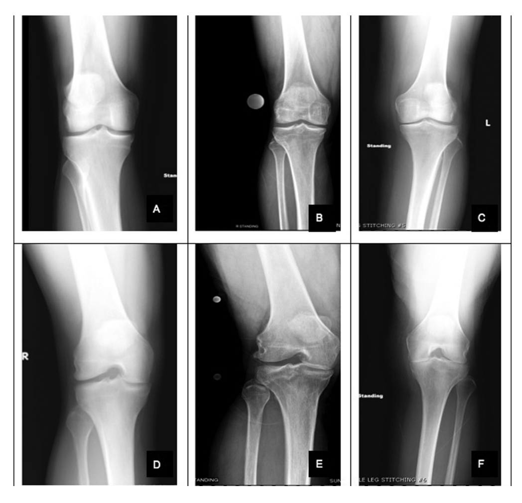
Figure 3. Three different patient extension anteroposterior (AP) radiographs with corresponding flexion posteroanterior (PA) radiographs directly below. Average Kellgren-Lawrence (KL) grades for each radiograph were determined to be the following: extension AP #1 (image A), 1; flexion PA #1 (image D), 3.5; image B, 1.75; image D, 4; image C, 2.25; image F, 4. In this study, flexion PA films were found to better illustrate tibial osteophytic lipping (D), femoral osteophytes (E), obliteration of the joint space (E and F), subchondral sclerosis (F), and deformation of bony ends (E and F).

be counseled and appropriately educated regarding expectations of knee pain and function. Aside from the significant clinical ramifications of using suboptimal imaging, physicians using only extension AP views may be exposing these patients to unnecessary risks of injection therapy and delays in definitive management.