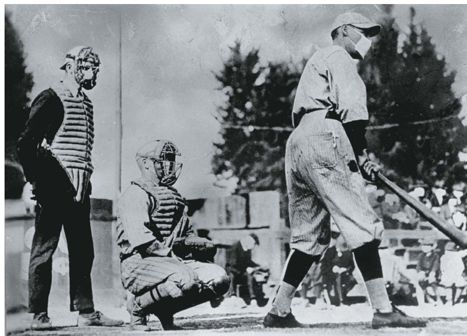
US baseball players wore masks while playing during the 1918 influenza epidemic.