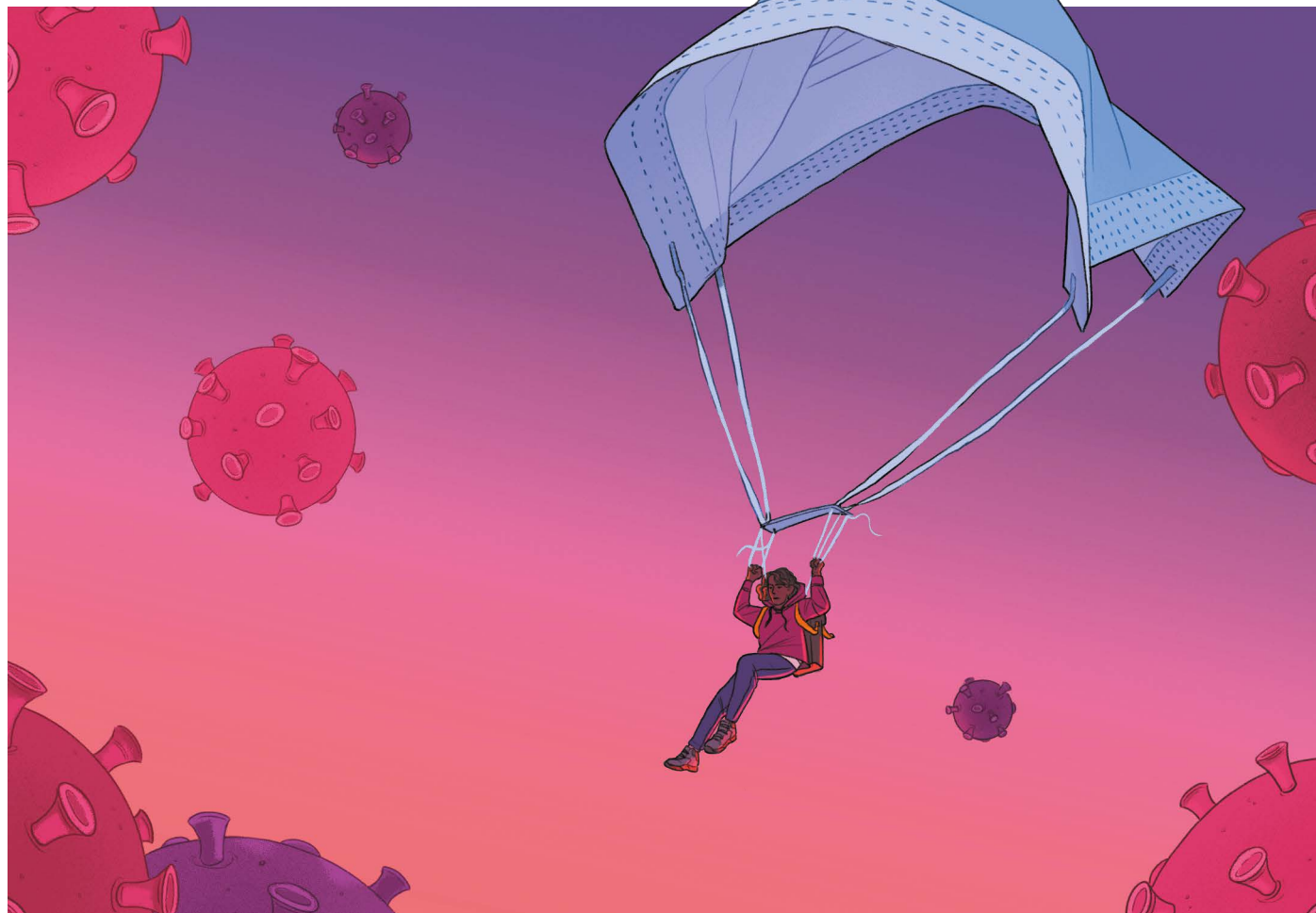
ILLUSTRATION BY BEX GLENDING