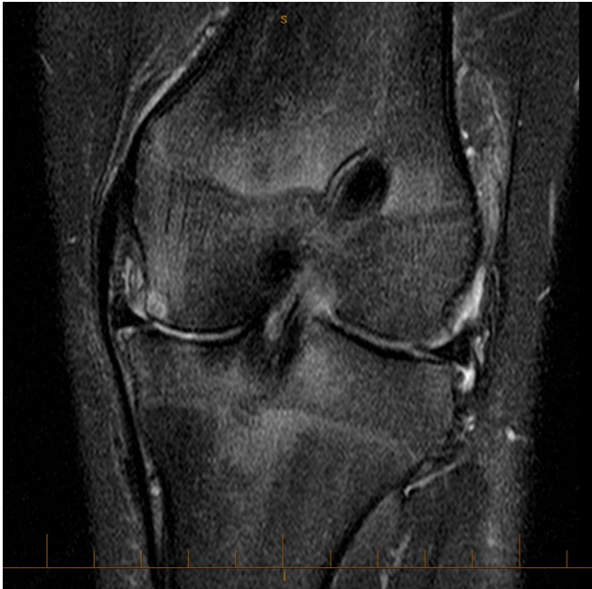
Fig. 2 T2-weighted magnetic resonance imaging scan acquired six months after surgery, demonstrating extensive tricompartamental chondrolysis.

swelling, hemarthrosis, or unexpected pain. Postoperatively, she had no complaints, but knee flexion was limited to 120° at eight weeks postoperatively. At that time, the patient underwent a manipulation of the knee under anesthesia (without the use of arthroscopy), and full flexion was obtained and maintained.