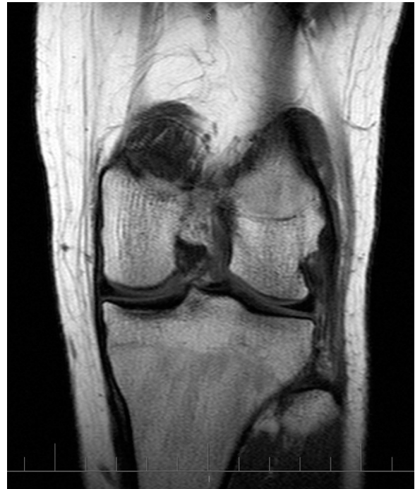
Fig. 1 T1-weighted magnetic resonance imaging scan acquired soon after the initial injury, demonstrating no evidence of cartilage damage.

A seventeen-year-old girl sustained anterior cruciate ligament and lateral meniscal tears during a tackling injury in a soccer game (Fig. 1). She underwent a routine anterior cruciate ligament reconstruction with use of quadruple ham-