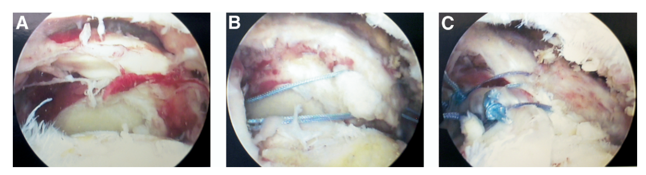
Figure 1 Use of margin convergence technique for large, U-shaped tear. A , Large, chronic, U-shaped tear. B , Passage of multiple sutures anterior to posterior in preparation for margin convergence. C , Margin convergence accomplished with approximation of rotator cuff to greater tuberosity.