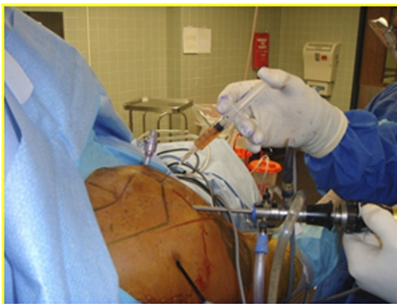
Figure 2 Insertion of syringe with PRP into rotator cuff repair under visualization.

Although both the beach chair and lateral decubitus positions have been described for rotator cuff repair surgery, we prefer to place the patient in a beach chair position to facilitate visualization of rotator cuff reduction. Before prepping and draping of the arm, a tourniquet is placed on the forearm, and an alcohol pad is used to prepare the most visible vein on the dorsum of the hand. Approximately 20 cm 3 of venous blood is drawn from the patient with a 22-G butterfly needle and prepared according to the manufacturer's guidelines. Although the withdrawn blood is being prepared, rotator cuff