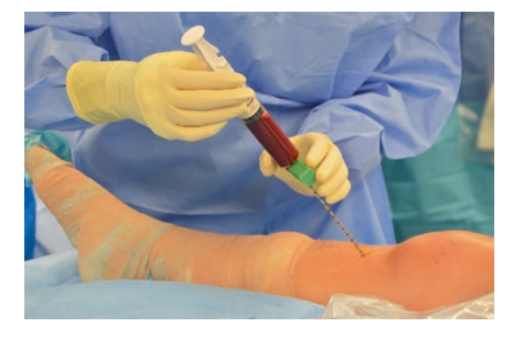
Fig. 45.1 Bone marrow aspiration from proximal tibia