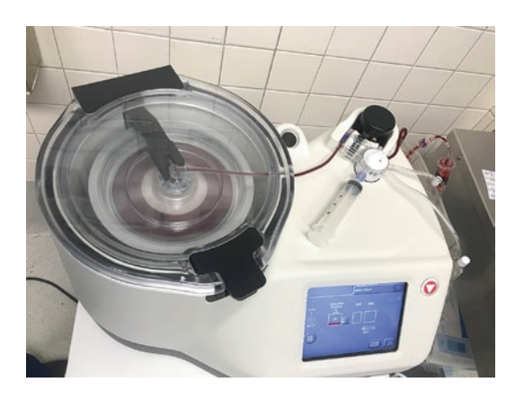
Fig. 45.2 Bone marrow aspiration centrifugation

different locations have been reported to increase progenitor cells concentration [43]. The bone marrow aspirate is then centrifuged in order to separate the mesenchymal stem cells (MSC) [44, 45] (Fig. 45.2). MSC concentration following centrifugation is still relatively low and is estimated to be around 0.001–0.01% [45]. Moreover, the true number of viable MSC that are actually delivered into the lesion is unknown, regardless of the tissue used to procure the cells. To increase the number of MSC, the cells are to be transferred to a lab and undergo cell isolation and culture expansion. However, such laboratory processing of cell preparations is prohibited in the United States, by the Food and Drug Administration (FDA).